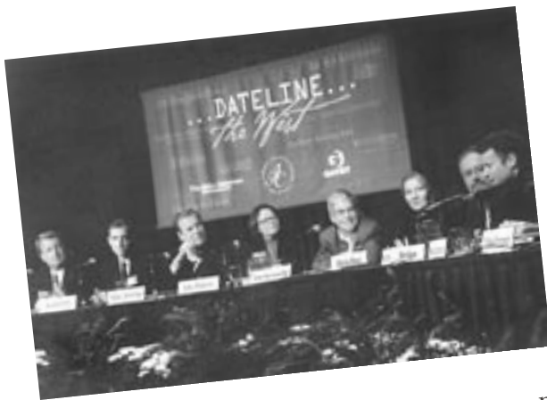
Panelists discuss the issues during the "Media's Struggle to Report the West" session.

A transcript of the entire conference and a conference report are available on the Andrus Center website ( www.andruscenter.org ) and may be downloaded without charge. Printed versions may be ordered through the Andrus Center.